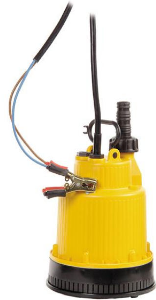
BABY BATTERY MANUAL

All Baby Battery pumps come with 5m of PVC power cable which is easily fitted with crocodile clips.